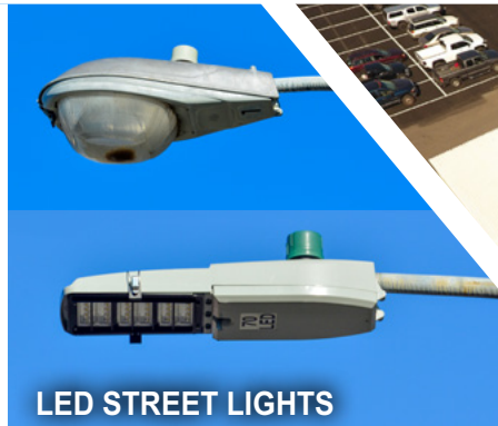
LED STREET LIGHTS