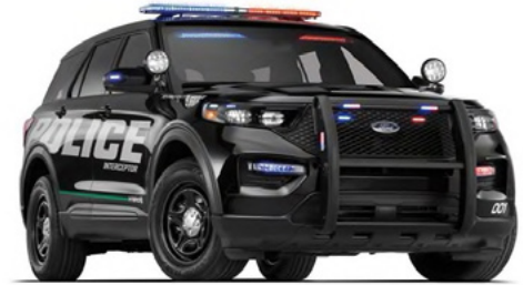
Hybrid police interceptors on order.