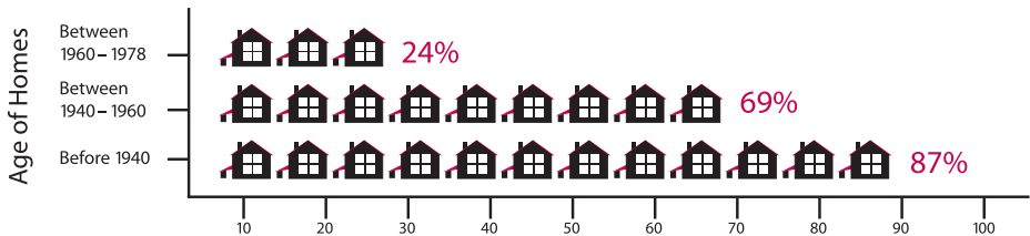
Percentage of Homes Likely to Contain Lead